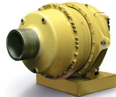
500kW gearbox for TGL EMEC demonstrator unit