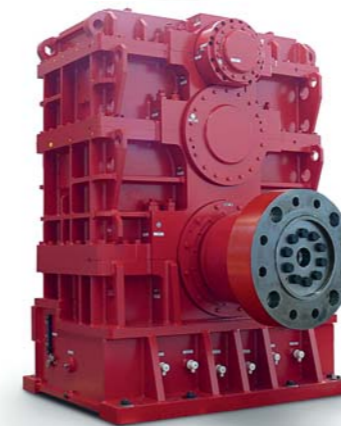
ZP-H gearbox for tidal barrage projects