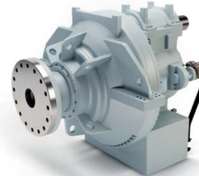
Visualisation of planetary gearbox for tidal barrage projects