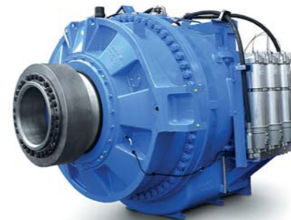
1500kW gearbox for AHH MeyGen project