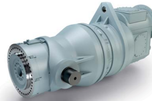
Visualisation of SeaGen gearbox