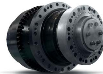
Orbi-fleX compact multi-satellite epicyclic gearboxes with high power density