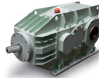
Bevel-helical gearboxes for conveying systems