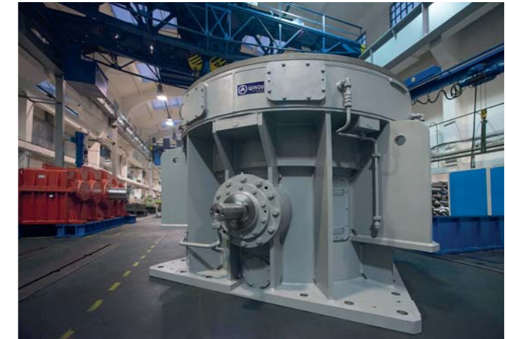
Vertical mill gearbox after refurbishment and upgrade