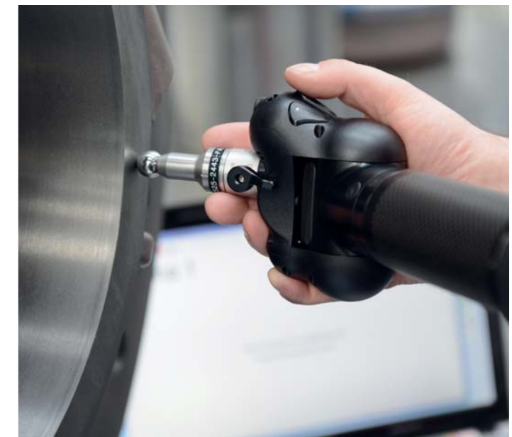
Mobile 3-D measurement of gearbox dimensions