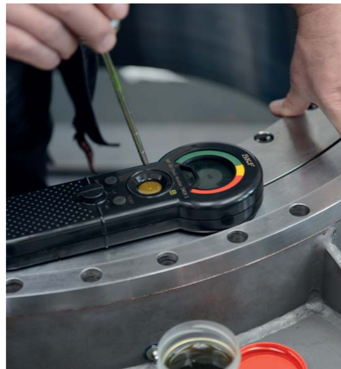
Oil quality measurement