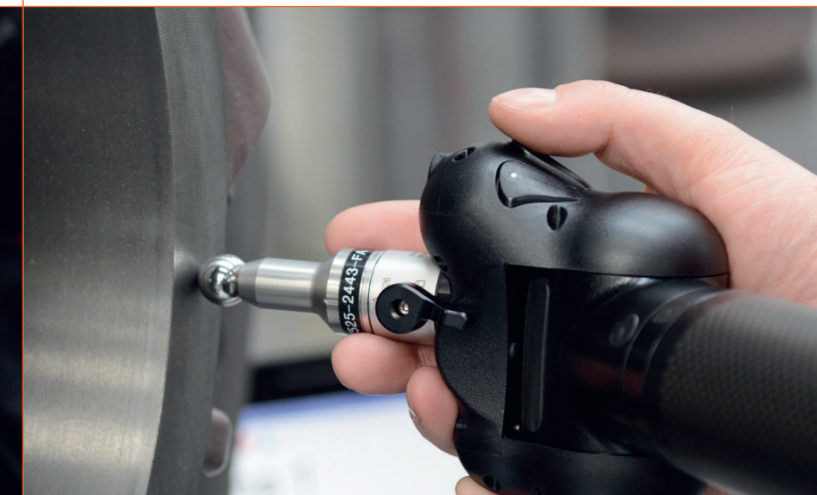
Mobile 3-D measurement of gearbox dimensions