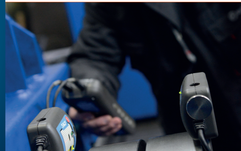
Coaxial shaft alignment