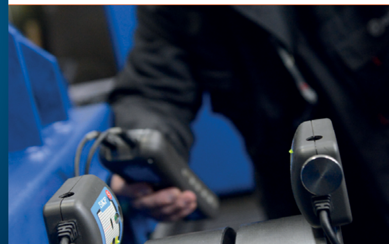
Coaxial shaft alignment