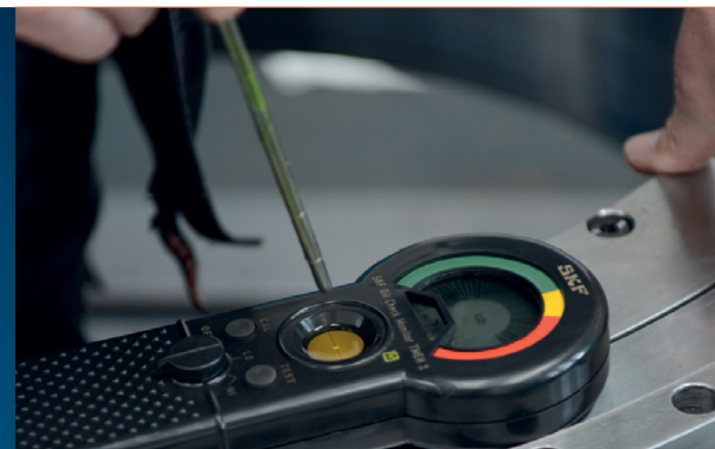
Oil quality measurement