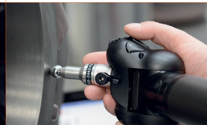
Mobile 3-D measurement of gearbox dimensions