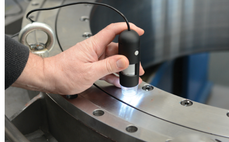
Microscopic surface inspection

OEM service for long life of your drive solution