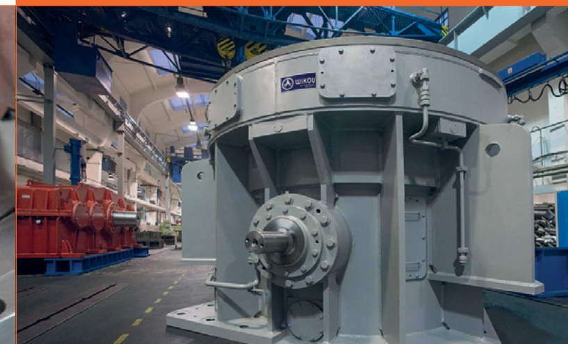
Vertical mill gearbox after refurbishment and upgrade