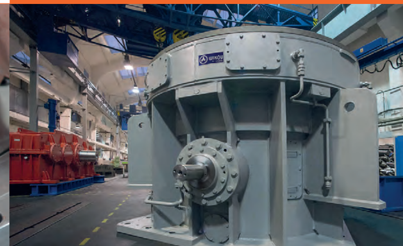
Vertical mill gearbox after refurbishment and upgrade