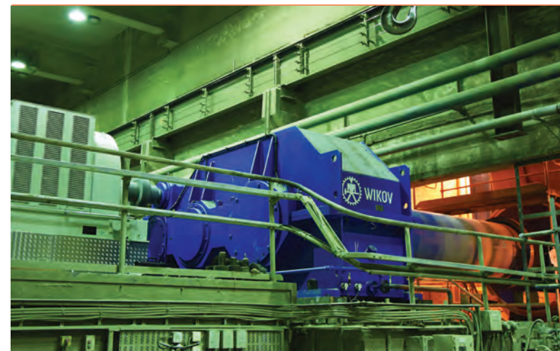
Drop-in replacement – horizontal ball mill drive