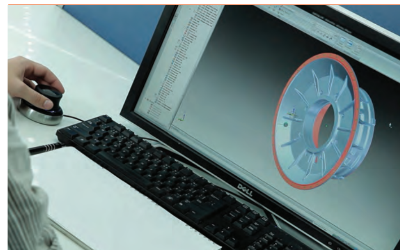
Reverse engineering and new design