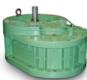
One-stage vertical gearbox for water pumping stations