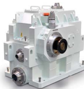
Feed-water pump gearbox RUB 280