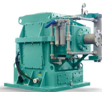
Fire-fighting pump gearbox