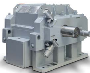
Boiler feed pump turbo gearbox RSB 250