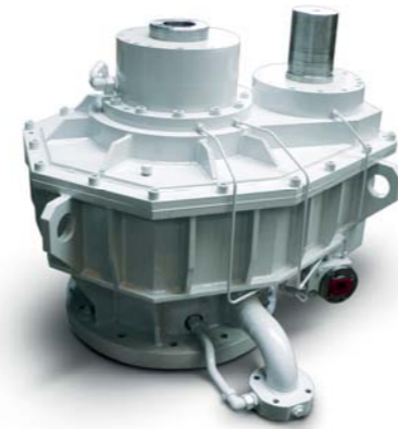
Helical vertical gearbox type ZP-V

Innovative planetary gear units up to 10 MW+