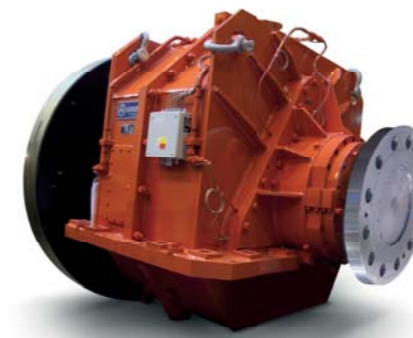
Helical coaxial gearbox type ZP-CX