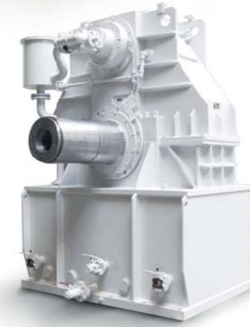
Helical horizontal gearbox type ZP-H

Horizontal and inclined Kaplan turbines (Bulb-type)