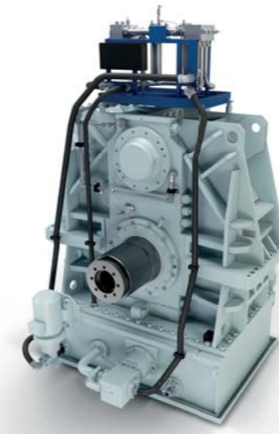
Helical horizontal gearbox type ZP-H

Horizontal and inclined Kaplan turbines (S-type and Pit-type)