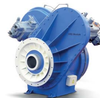
VRS unit (Variable Ratio System)