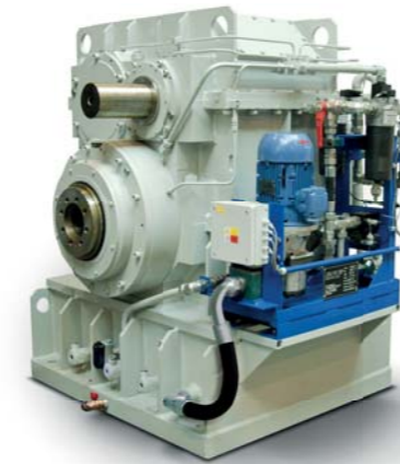
Helical horizontal gearbox type ZP-H

Innovative planetary gear units up to 10 MW+