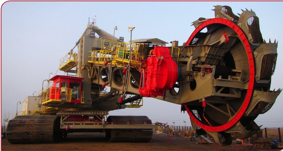
Above: An Orbi-flex with flexible-pin integrated into a bevel-helical planetary gearbox for a bucket wheel drive.

developments since acquiring Orbital2 have added further value and bring a top-quality solution to the market.