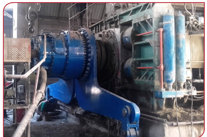
Right: Orbi-flex planetary gearboxes driving a roller press in a cement plant.

Overload Stop installations in wind turbine gearboxes provided very strong evidence of the effectiveness of this solution. A gearbox opened after 10 years of operation in a wind turbine uncovered the condition of the key components such as gears and bearings. They appeared to be untouched.