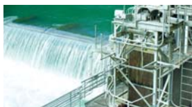
Hydro energy: hydro power plant drives