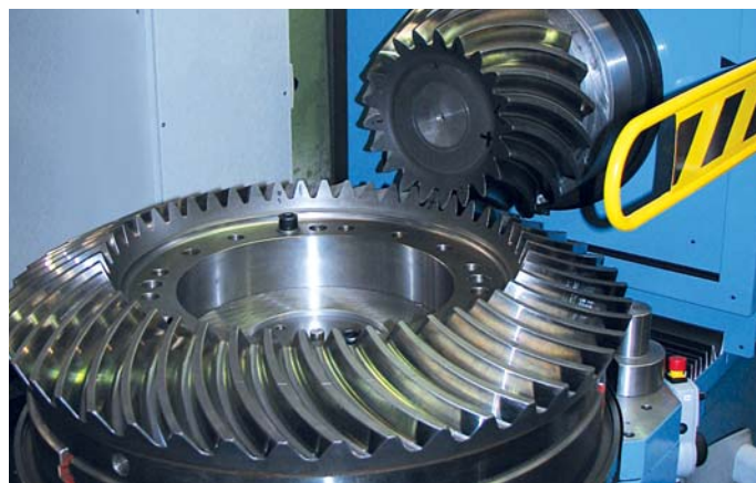
Testing unit IMO 1000