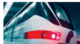
Rail vehicles: bevel gear sets for trams and railcars