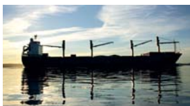
Shipbuilding: drives for ships and thrusters