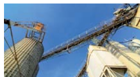
Mineral processing: cone crushers